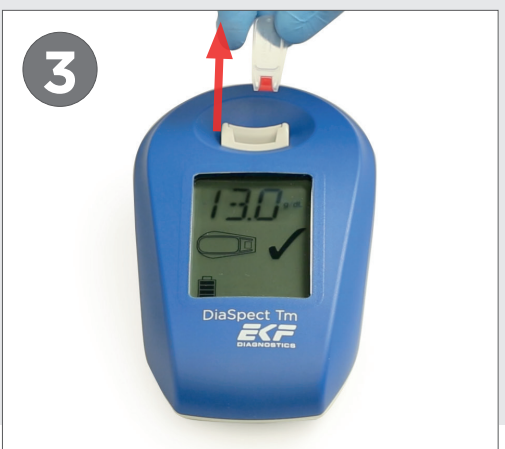
Pull out the cuvette quickly. Record the result as soon as the checkmark is shown