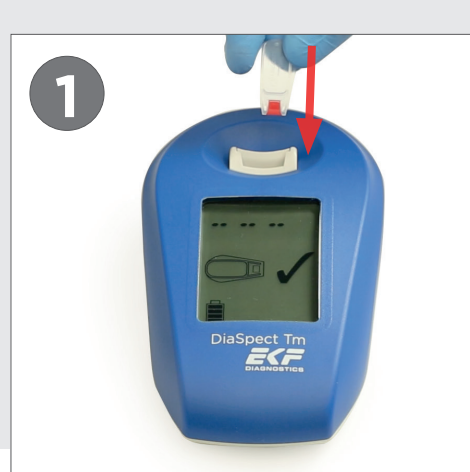
Insert the filled cuvette, press down gently and hold in position