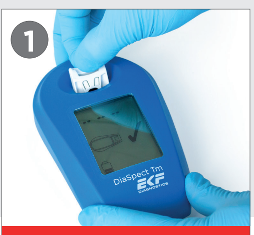
Pull the backside of the cuvette holder slightly towards you and lift up

Use conventional solvent-free surface disinfectants, or alcohol based substances such as 70% isopropyl alcohol. Do not spray the instrument!