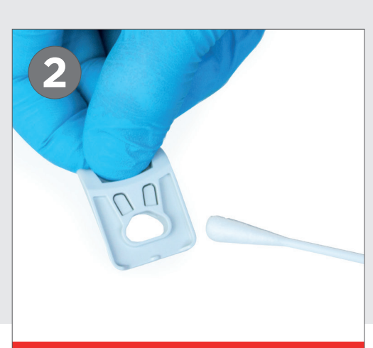
Clean cuvette holder with cold water or mild detergent, followed by disinfectant