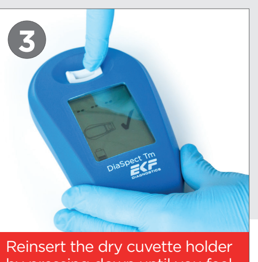
Reinsert the dry cuvette holder by pressing down until you feel a "click"