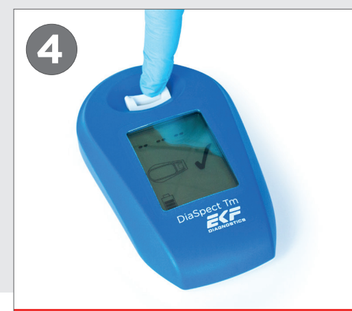
The result is displayed until the next measurement or until pressing down the cuvette holder