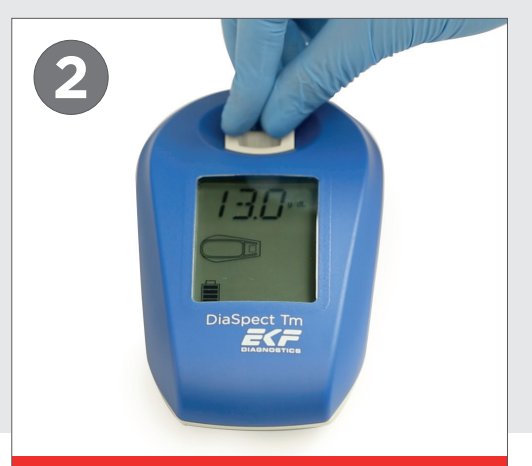
The hemoglobin value will be displayed instantly